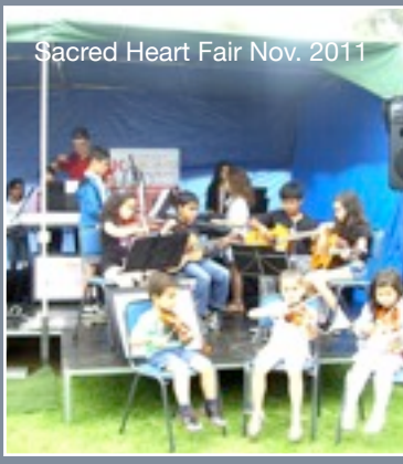
Sacred Heart Fair Nov. 2011