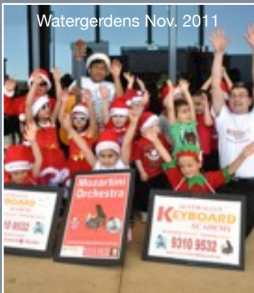
Watergardens Nov. 2011