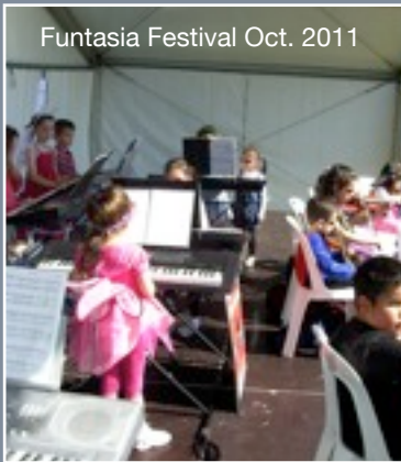
Funtasia Festival Oct. 2011