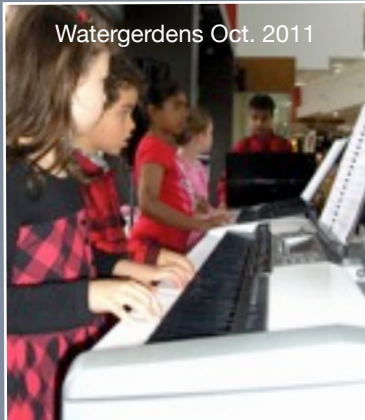
Watergardens Oct. 2011